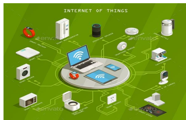
Figure 2: Internet of things

Smart building design can greatly enhance the user experience in public libraries through personalized services and improved comfort levels. Kumar et al. (2021) explored the integration of ambient intelligence and smart technologies to provide personalized library spaces tailored to individual preferences. They found that such systems can increase user satisfaction and engagement. Kari and Seppo (2022) highlighted the significance of smart HVAC systems in maintaining optimal thermal conditions and indoor air quality, thus improving user comfort and well-being. Figure 2 shows internet of things.