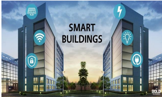
Figure 3: A smart building (green.org)

resources. Also, despite the benefits of implementing smart building design in public libraries it can pose several challenges. Zoeteman et al. (2014) highlighted interoperability issues and the need for standardized protocols to ensure seamless integration of various smart technologies. A smart building is displayed in Figure 3.