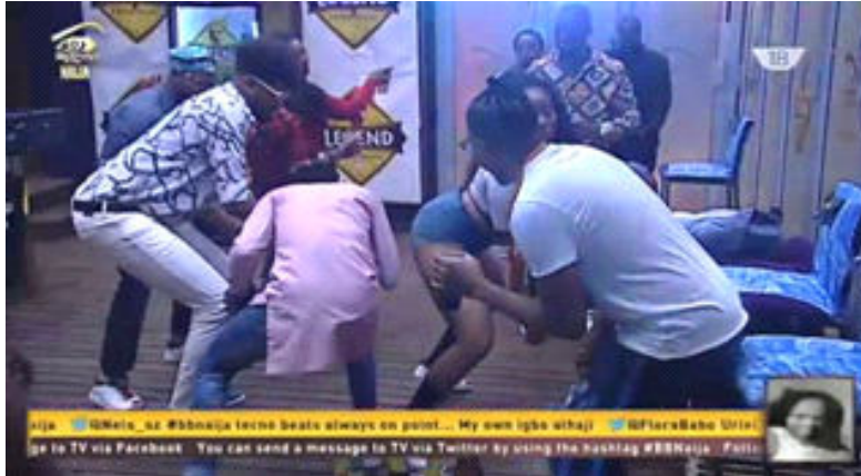
Plate 8: voyeurism and exhibitionism in dancing