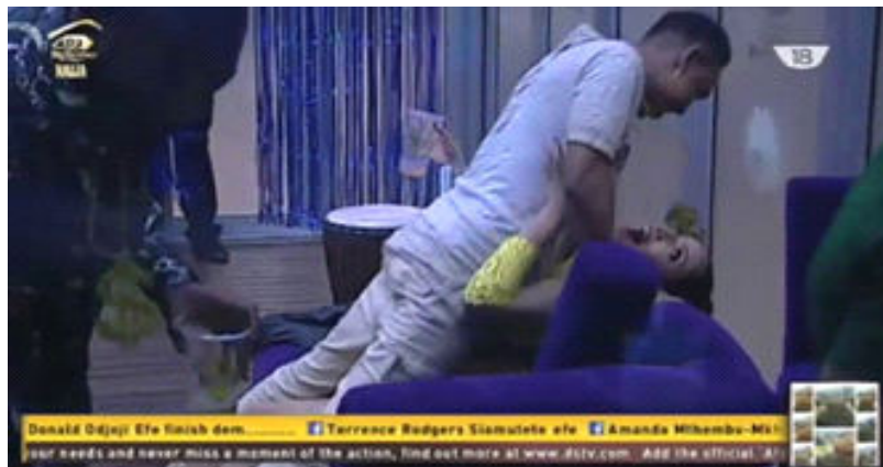
Image 16 is also classified as frotteurism exhibited in dancing as a higher-level action. Although dancing, the participants take up a sexually suggestive position presented in their proxemics (intimate space), posture and gesture (open) limbs, and sequentially structured gaze focused on each other's faces. The facial expression corroborates the fact that it is amorous, deliberate, and consensual.